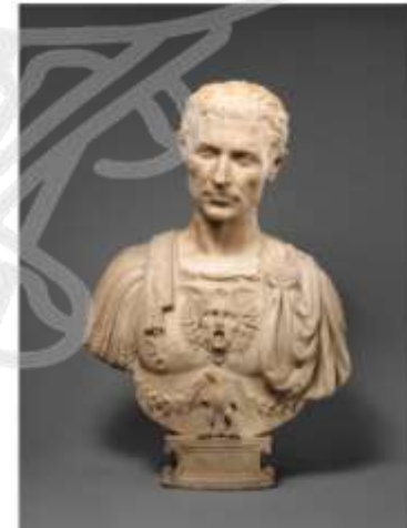
Statue of Julius Caesar

Julius Caesar was victorious and in 44 BCE, he declared himself dictator of Rome.