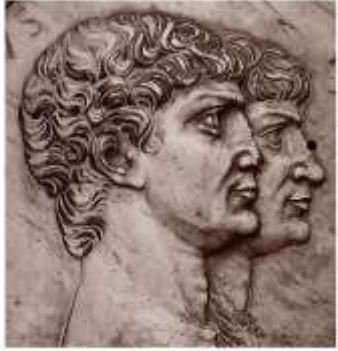
Sculpture of Romulus

The myth of Romulus and how he founded Rome was important to Romans: it showed that to be Roman was to be strong and powerful.