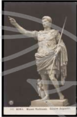
Statue of Augustus

The myth of Romulus and how he founded Rome was important to Romans: it showed that to be Roman was to be strong and powerful.