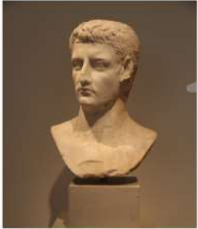
Photo of a bust of the Emperor Claudius.

Claudius invaded Britain in 43 CE. If Claudius could conquer these tribes, he would prove he was a strong emperor. The ancient Roman armies were well trained and used clever tactics to defeat Celtic tribes in the south-east of Britain.