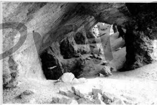
SEVEN SISTERS CAVERN