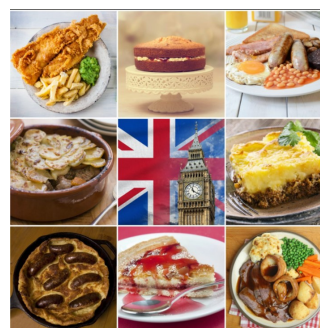
Traditional British Foods