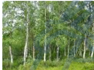
These are Silver Birch Trees.

You can easily recognise it by looking at its leaves and acorns.