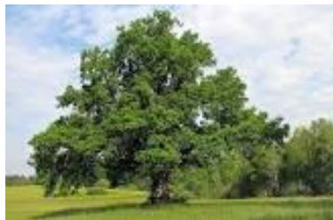
This is an Oak Tree.