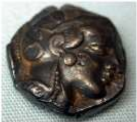
An Ancient Greek coin from Athens.