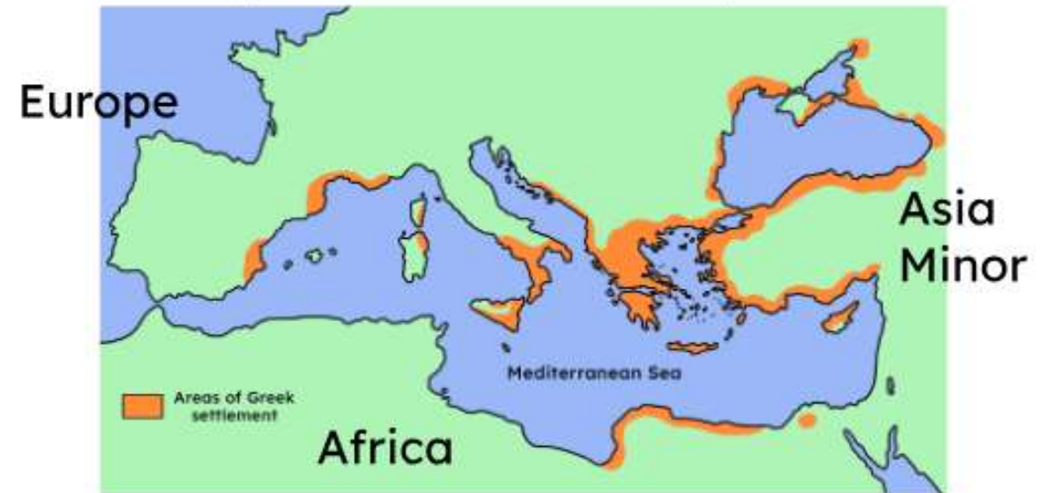
Map of Ancient Greece at its peak

Photo of the highest point on Mount Olympus, Mytikas Peak.