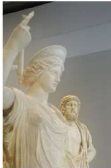
Statues showing Hera and Zeus