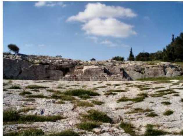
Modern photo of the Pnyx

The Athenian people formed the first ever democracy. Men gathered at a monthly meeting called the Assembly where important decisions were made.