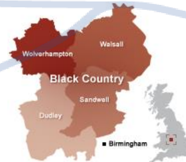
Location of The Black Country