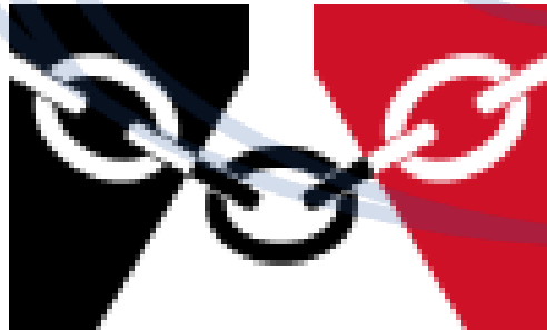
Black Country flag