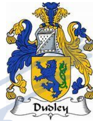
Crest of Dudley

Can you make a list of the landmarks in Dudley?