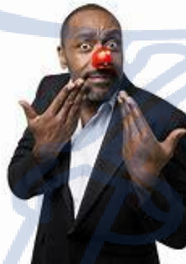
Sir Lenny Henry, actor and comedian